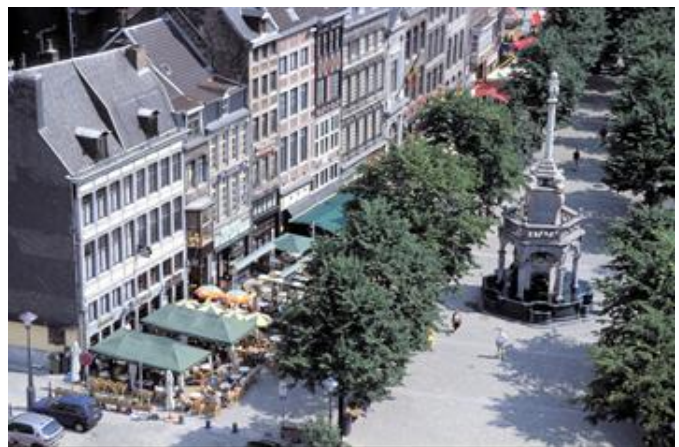
Le Perron, place du Marché

Bruxelles bilingue Communauté Française Communauté Flamande Communauté Germanophone