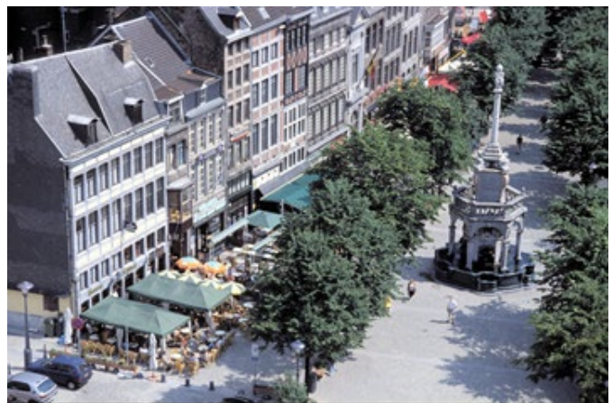
Le Perron, place du Marché

Bruxelles bilingue Communauté Française Communauté Flamande Communauté Germanophone