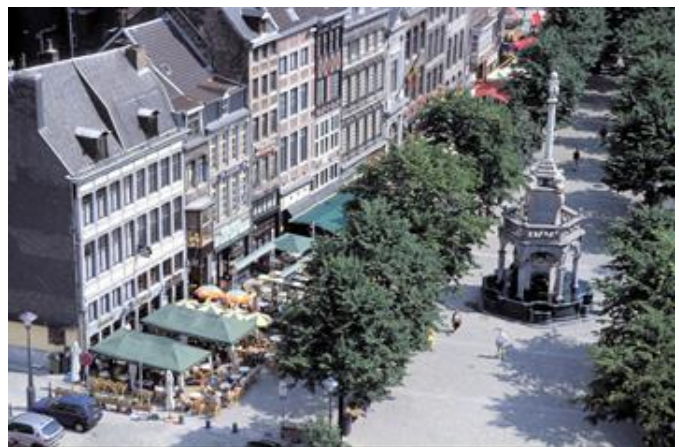
Le Perron, place du Marché

Bruxelles bilingue Communauté Française Communauté Flamande Communauté Germanophone