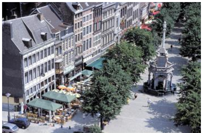
Le Perron, place du Marché

Bruxelles bilingue Communauté Française Communauté Flamande Communauté Germanophone