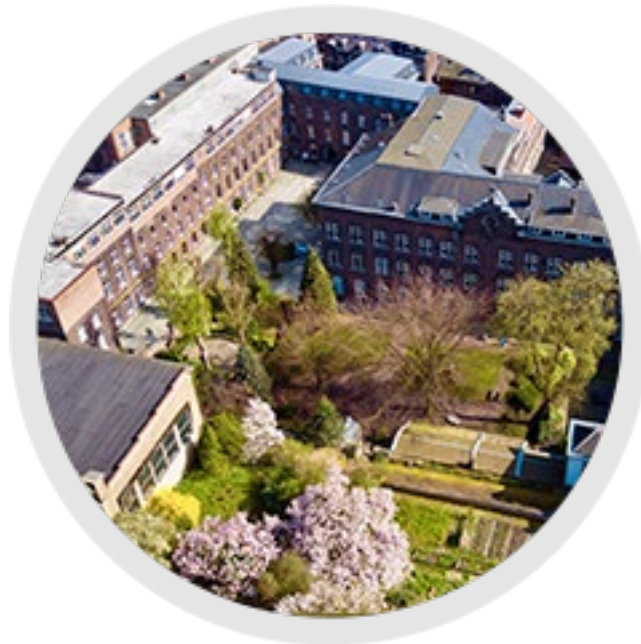
HELMo Campus des Coteaux