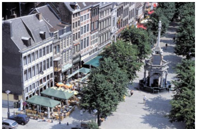
Le Perron, place du Marché

Bruxelles bilingue Communauté Française Communauté Flamande Communauté Germanophone