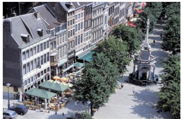
Le Perron, place du Marché

Bruxelles bilingue Communauté Française Communauté Flamande Communauté Germanophone