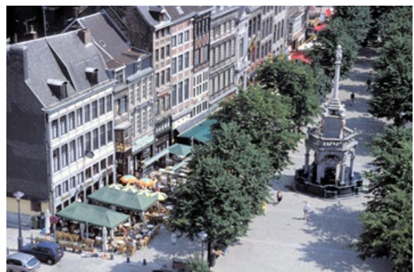
Le Perron, place du Marché

Bruxelles bilingue Communauté Française Communauté Flamande Communauté Germanophone