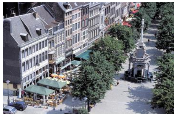
Le Perron, place du Marché

Bruxelles bilingue Communauté Française Communauté Flamande Communauté Germanophone