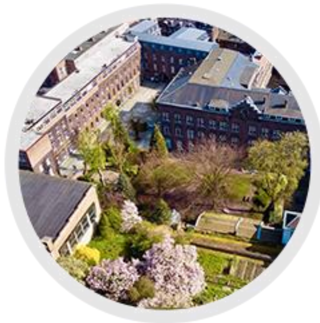
HELMo Campus des Coteaux